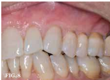
(5.) Loose sutures were removed 11 days postoperatively. (6.) Esthetic, significant root coverage at 6-month follow-up. (7. AND 8.) At 18-month follow-up, all treated teeth demonstrated 80% to 100% root coverage and a healthy band of keratinized gingiva.