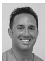
BARRY P. LEVIN, DMD

Acellular dermal allografts are mainly composed of collagen. These materials can augment soft tissue thickness and are not likely to elicit a local or systemic immune response. The combination of rhPDGF-BB and dermal allografts provides a bioactive matrix for corrective mucogingival surgery.