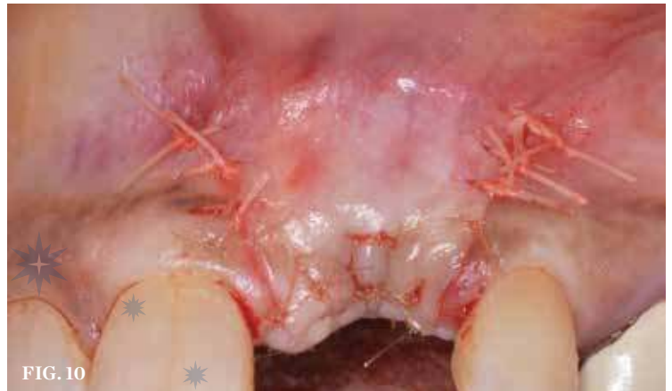
(6.) A 3.6-mm diameter implant was removed with a 4.0-mm diameter trephine drill. The apical portion of the implant was luxated carefully to preserve as much bone as possible. (7.) Because apical and lateral bone volume was preserved with use of an ultrathin trephine, a wider diameter, 4.2-mm implant was placed at the time of implant removal. Bone augmentation was performed, and submerged healing was selected. (8. AND 9.) A cross-linked collagen scaffold consisting of FDA/DBBM in a 4:1 ratio is placed over the particulate bone graft. (10.) Primary, submerged closure is achieved over the newly placed implant and regenerative biomaterials.