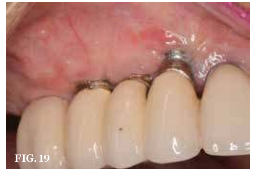
(15.) Due to physiologic remodeling of the alveolar ridge, facially inclined implant positions, and ineffective augmentation at time of placement, these three implants are experiencing mucosal recession. (16.) Following flap reflection, the buccal bone deficiencies are evident. (17.) A cross-linked collagen bone graft scaffold is applied over the debrided implant surfaces to help reconstruct a portion of the deficient buccal bone. (18.) A subepithelial, connective tissue graft from the palate is affixed over the collagen bone scaffold and around the abutments of the three involved implants. (19.) At 1-month postoperatively, partial coverage of the exposed abutments/implant platforms has occurred. There is now a band of keratinized mucosa, and the patient is instructed in nontraumatic plaque removal protocols. Follow-up to monitor long-term maintenance of the regenerated keratinized mucosa is encouraged.